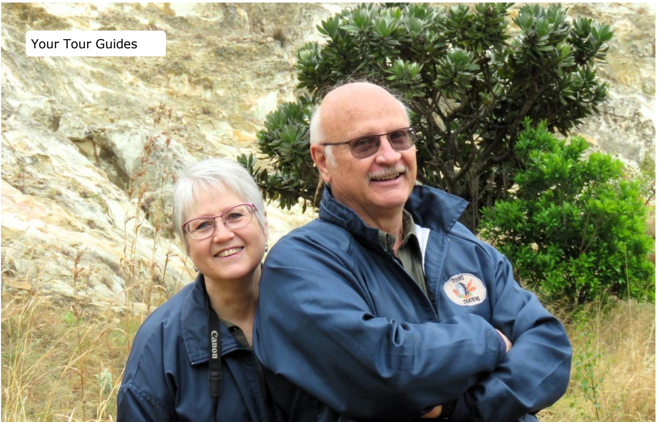
Your Tour Guides